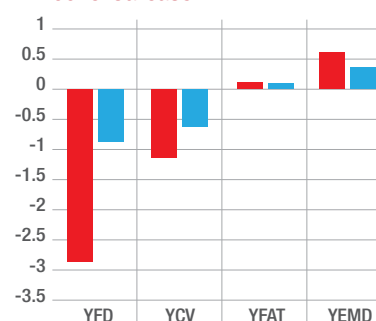
Wool & Carcase

■ Average Yalgoo Semen Sire ■ Average Merino 2020 Drop